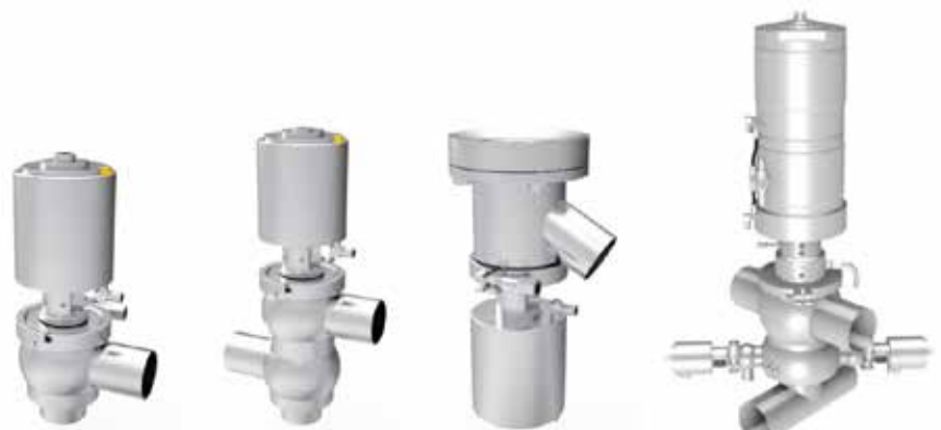
SVP Select Single Seat Valve Series

In both valve types the advanced seal technology supports all performance areas of the proven Südmö valve technology, including Südmö's minimized maintenance requirements and easy service handling.